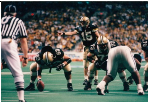
Drew Brees – QB, Purdue