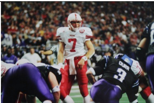
Eric Crouch – QB, Nebraska