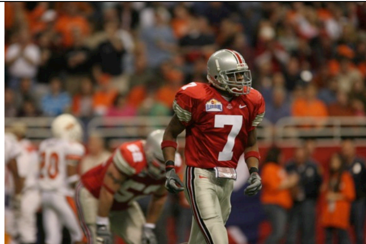
Ted Ginn Jr. - WR, Ohio State