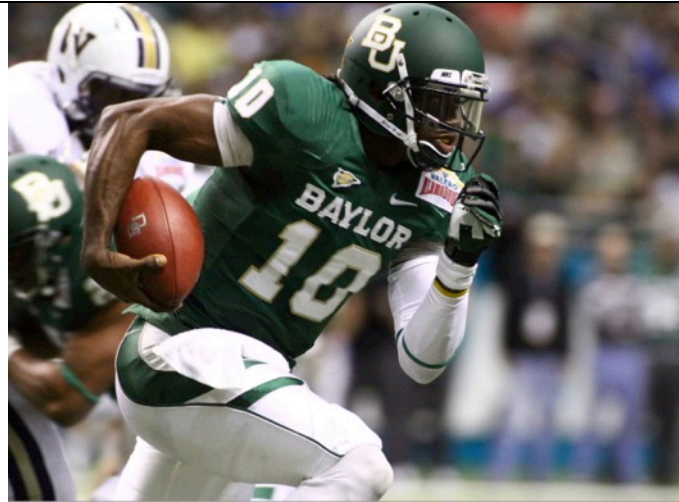
Robert Griffin III - QB, Baylor