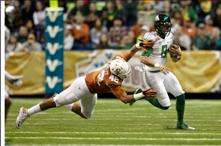
Marcus Mariota - QB, Oregon

Valero Alamo Bowl | Monday, December 30, 2013 #10 Oregon 30 vs. Texas 7